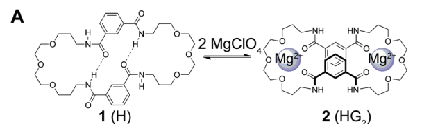
Fig. 3 (A) The structure of the host (H) 1 and its 1:2 host–guest ( \text{HG}_2 ) complex 2 . (B) The four different binding models (flavours) based on (7) that can be used to describe a 1:2 equilibria. Reproduced with permission from ref. 18.

The most useful indicator used to select a binding model in this study was \text{cov}_{\text{fit}} obtained from (12). The more complex model, and hence the number of parameters fitted, the better the fit generally is. To justify the selection of a more complex model such as the full 1:2 model over a simpler 1:2 additive model,