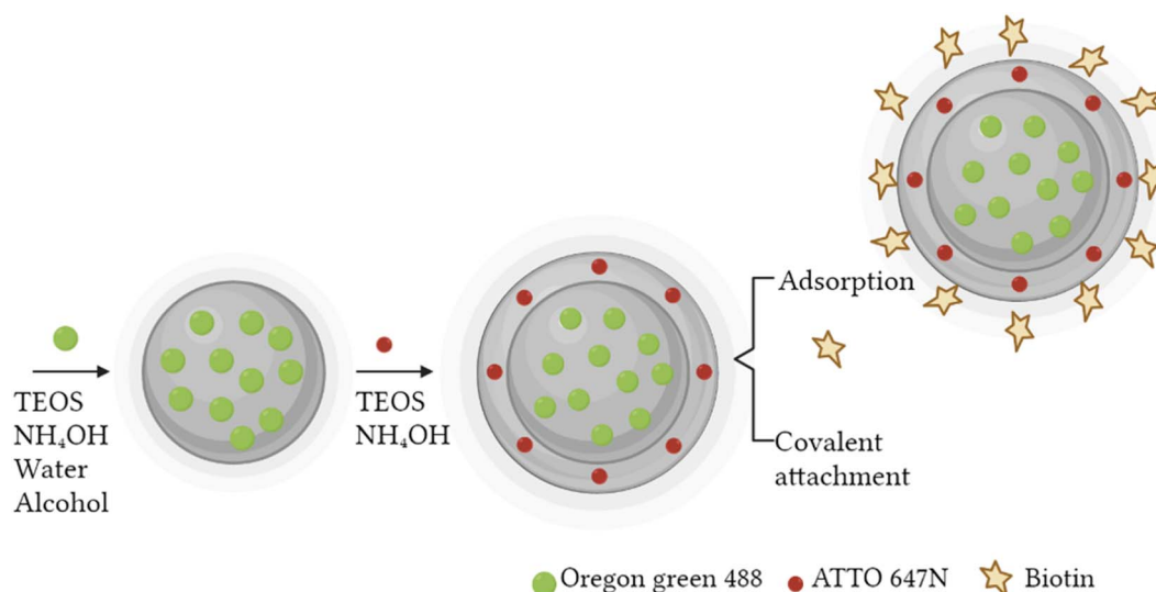
Fig. 1 Schematic representation of two-cycle Stöber method (created by Biorender).

A fast, simple, and reproducible method for the synthesis of dual-color SiO 2 NPs is proposed herein. The two-cycle Stöber