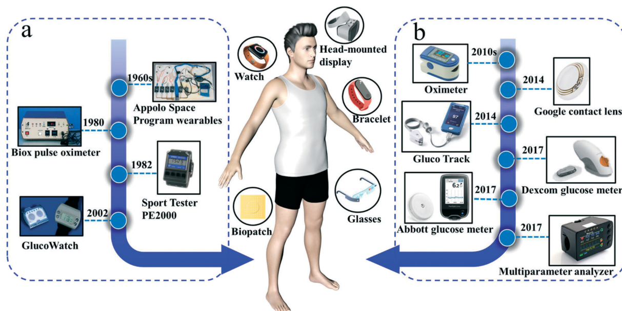
Fig. 1 The development of commercial translation for health monitoring wearable devices. (a) The past wearables for health monitoring. From the top: an initial prototype wearable equipment for astronauts in 1960s, an oximeter equipment worn on fingers in 1980, a watch-like wearable for heart rate monitoring in 1982, a wearable glucose meter based on iontophoresis in 2002. (b) The present advanced commercial wearable devices for patient-friendly diagnosis. From the top: a fingertip worn oximeter produced by Contec, Inc. (Hebei, China) in 2010s, Google contact lens for glucose biosensing and wirelessly transmitting signal in 2014, Gluco Track (Cnoga, Inc., Israel) as a finger clip for non-invasively monitoring glucose based on optical absorption and reflection in 2014, a G5 continuous monitoring wearable device (Dexcom, USA) for ISF glucose based on electrochemical platform in 2017, Abbott Freestyle Libre (Abbott, Inc.) for ISF glucose monitoring during 14 days by entrapping glucose oxidase on a soft conductive bio-needle in 2017, a fingertip analyzer produced by Cnoga, Inc. for multiplexed analysis based on optical absorption and reflection in 2017.

Commercial wearable products on the market, such as wearable blood glucose meters, undergo a long period of evolution before they can be meaningfully promoted. The predecessor of wearable blood glucose meters is a biosensor for glucose detection developed by Leland Clark and Ann Lyons of Cincinnati Children's Hospital in 1962. After a long period of research on non-invasive wearables, Cygnus launched the GlucoWatch product in 2002.