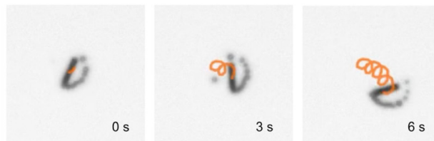
C Time lapse of \text{MnO}_2/\text{Lac} micromotor trajectories at 2 wt. % \text{H}_2\text{O}_2