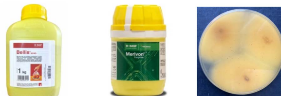
Fig. 4 Inhibition of growth of Aspergillus niger (strain VURV-F 822; measured as a diameter of the inhibition zone, mm) with boscalid, bixafen, fluxapyroxad, and their analogs 28–30 at different concentrations after 48 h of incubation. Fungicides boscalid (@Bellis) and bixafen (@Merivon) are shown. Inhibition of fungal growth by compound 29.

Lipophilicity. To estimate the influence of the replacement of the ortho -benzene ring with bicyclo[2.1.1]hexane on lipophilicity, we used two parameters: calculated lipophilicity (clogP) 27 and experimental lipophilicity (logD).