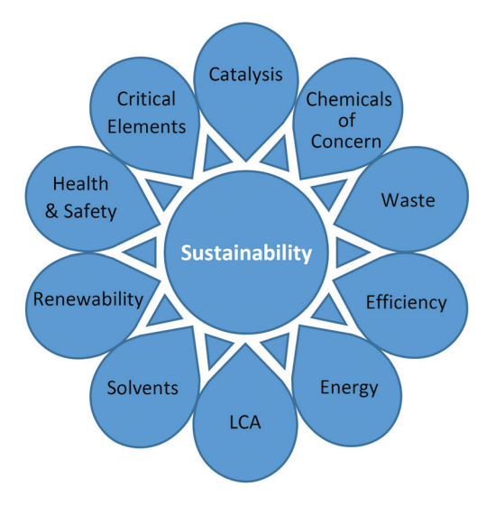
Fig. 1 Summary of the key parameters covered by the metrics toolkit.

A gap analysis was performed to compare current methods against the lifecycle of a typical active pharmaceutical ingredient (API). Subsequently, a number of 'key parameters' were identified which were chosen to cover a comprehensive range of relevant issues regarding the synthesis of chemical products. In this way, the focus was expanded significantly from simply adopting a traditional mass inputs/outputs approach. A summary of the key parameters is shown in Fig. 1. In order to be included in the toolkit, parameters needed to meet the criteria of being able to be practically and consistently measured/ assessed in a laboratory based setting. Following an in-depth critical analysis, favoured quantitative metrics were selected to cover the key parameters. These were supplemented by additional qualitative parameters (where no straightforward calculation is possible).