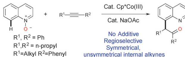
Scheme 1 Co(III) catalyzed C–H activation/oxygen atom transfer process.

A summary of the results for the optimization is presented in Table S1 (ESI†). 16 We began our investigation using quinoline- N -oxide 1a , as a model substrate, and diphenylacetylene 2a in the presence of Cp*Co(CO)I 2 (10 mol%) and NaOAc (20 mol%) in dioxane at 80 °C for 24 h; this did not give the expected product 3a . A solvent dependency study for the same reaction was carried out (Table S1, entries 2–8, ESI†) and we found that the reaction proceeded more efficiently in TFE (trifluoroethanol) compared to other solvents, with an isolated yield for 3a of 80% (Table S1, entry 2, ESI†). An improved yield for 3a was obtained when we employed NaOPiv (Table S1, entry 14, ESI†) compared to other