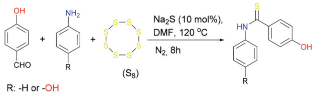
Scheme 5 Synthesis of 4-hydroxy- N -(4-hydroxyphenyl)benzothioamide (dihydroxythioamide) and 4-hydroxy- N -phenylbenzothioamide (monohydroxythioamide).

After the synthesis of dihydroxythioamide and monohydroxythioamide, benzoxazine monomers were synthesized via the classical route (Scheme 6) where furfuryl and benzylamines were selected as primary amines along with paraformaldehyde. In the synthesis, a toluene/ethanol mixture was deliberately selected as the solvent to decrease the triazine formation in the synthesis of thioamide based benzoxazines. The chemical structures of the benzoxazines were confirmed by ^1\text{H} NMR, ^{13}\text{C} NMR (Fig. S6–8†) and FTIR spectral analyses. The ^1\text{H} NMR spectra of the Th-amd-MonoBz-Bn, Th-amd-MonoBz-Fr and Th-amd-DiBz-Bn are presented in Fig. 1. The appearance of the proton signals at 4.95, 4.92, ( \text{O}-\text{CH}_2-\text{N} ) and 3.98, 4.00, ( \text{Ar}-\text{CH}_2-\text{N} ) for Th-amd-MonoBz-Bn and Th-amd-MonoBz-Fr confirms the oxazine rings, respectively. Th-amd-DiBz-Bn is anti-symmetric and the benzoxazines are not identical, thus it has two different oxazine rings. Therefore, in Fig. 1c, the proton signals are observed at 4.94, 4.87 ( \text{O}-\text{CH}_2-\text{N} ), 3.97, 3.91 ppm ( \text{Ar}-\text{CH}_2-\text{N} ). Moreover, the singlet peaks at 3.87, 3.86, and 3.85 ppm stem from Aryl- \text{CH}_2- (benzylic) and furan- \text{CH}_2- (furylic). Besides, the aromatic peaks of the furan group are visible at 6.82, 6.42, and 6.33 ppm for Th-amd-MonoBz-Fr. Moreover, the proton signals of thioamide N–H