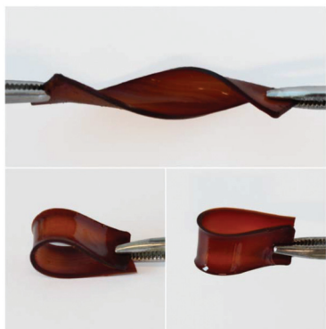
Fig. 3 Images of the cured poly(thioamide-benz-PPEO) film.

signals of the Jeffamine moiety are between 3.6 and 3.09 ppm, and those of the aliphatic protons are at 1.06–0.99 ppm. The FTIR spectrum of poly(thioamide-benz-PPEO) (Fig. S12†) further confirms the structure of the polymer. The IR spectrum shows the characteristic C–O band of the ether structure of Jeffamine at 1092\text{ cm}^{-1} . Moreover, the oxazine skeletal vibrations of C–H appear at ca. 920\text{ cm}^{-1} providing another evidence to support the presence of the ring structure in the main chain structure. In addition, the thioamide N–H stretching vibration is detectable at around 3270\text{ cm}^{-1} . In contrast, thiocarbonyl (C=S) is not visible due to the overlapping C–O bands of Jeffamine units.