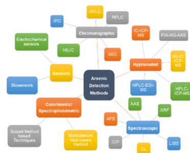
Fig. 3 Different methods of arsenic detection and determination.

The purpose of this review is to provide an overview of the analytical techniques (chromatographic, spectroscopic, colorimetric, biological, electroanalytical and coupled techniques) for arsenic determination in drinking water and the authors have mostly covered the literature over the past decade (2010 onwards). Some older publications are referenced to support the key concepts and wherever necessary. A brief introduction to various analytical techniques followed by an evaluation of their capabilities and performance for arsenic determination are discussed. Associated challenges as well as potential avenues for future research, including the demand for rapid analysis and on-site technologies for remote water analysis and environmental applications are discussed. We hope that this review