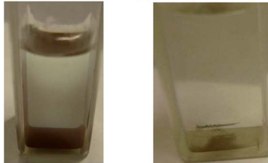
Fig. 1 Visual observation of the disproportionation of CuBr in DMSO with 0.5 equivalent (a); and 1 equivalent (b) of Me 6 -TREN after 3 h at 25 °C. Conditions: DMSO = 1.8 mL; (a) [CuBr]/[Me 6 -TREN] = 1/0.5 and (b) [CuBr]/[Me 6 -TREN] = 1/1.