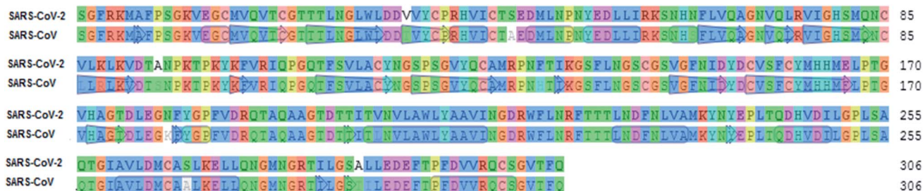
Fig. 2 Sequence alignment for the amino acids of M pro between SARS-CoV-2 and SARS-CoV M pro .