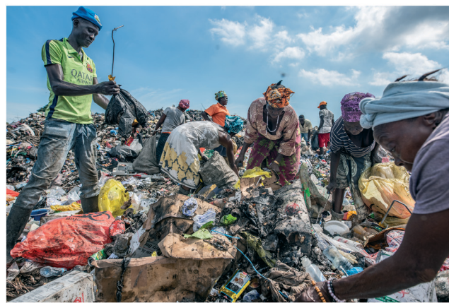
Fig. 2 Left: Operator moving waste after incineration in a public referral hospital, Sierra Leone. Right: People at public rubbish dump pick through the medical waste from a Community Health Post (CHC), Western Rural Area, Sierra Leone.

which are used in some low-resource settings, will not. In addition, when dumped in landfills (Fig. 2), plastics will persist for hundreds of years in the soil. The sustainability and safety of single-use POCTs could, to various degrees, be improved by technological solutions.