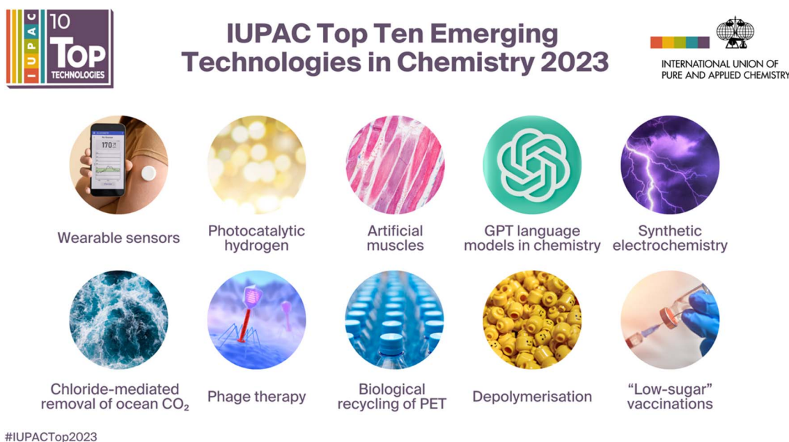
Fig. 2 A picture showcasing the latest “Top Ten” Emerging Technologies in Chemistry, an initiative pioneered by IUPAC.