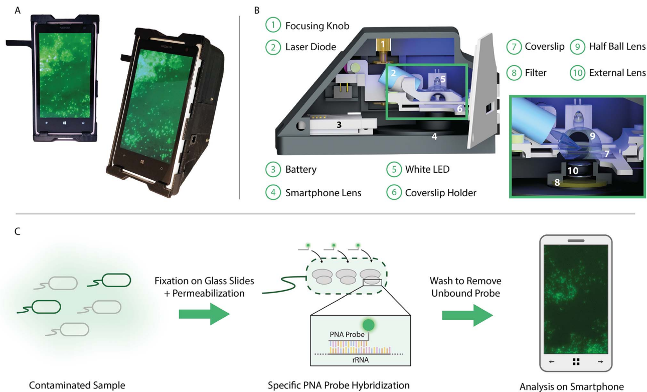
Fig. 1 Selective targeting and imaging of single bacteria on a smartphone. (A) Photographs of a smartphone microscope displaying images of fluorescently labeled Cronobacter spp. bacteria. (B) 3D illustration of the same optomechanical unit that is mounted on the smartphone in (A). (C) Schematic illustration of the bacterial detection procedure. Bacteria from the contaminated sample are fixed on 22 \times 50 \text{ mm}^2 glass slides and the bacterial membrane is permeabilized in order for the PNA probe to enter the bacteria. An Alexa Fluor 488 dye is chemically linked to the PNA probe which in turn is designed to bind specifically to certain regions of the ribosomal RNA (rRNA) of the bacteria. After washing away unbound probes, only the targeted bacteria remain fluorescent and can be imaged using the smartphone-based microscope shown in (A).

\mu\text{m} , yellow-green fluorescent (505/515), ThermoFisher) in ultra-pure water, with concentrations ranging from 10^2 to 10^8 beads per mL. Twenty \mu\text{L} were placed on a coverslip ( 22 \text{ mm} \times 50 \text{ mm} , Premium Cover Glass 12-548-5E, Fisher Scientific) and the solution was allowed to evaporate at room temperature prior to imaging, leaving only the fluorescent beads on the glass coverslips.