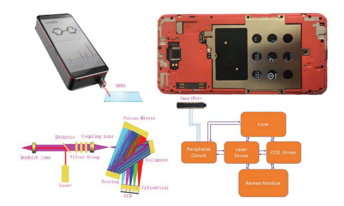
Fig. 1 The schematic illustration of the smartphone-based SERS analysis.

As shown in Fig. 1, the 785 nm parallel laser emitted by the laser device is irradiated through a dichroic filter, so that the incident laser can be reflected to the doublet lens located at a 45 degree angle and then focused on the measured target. The Raman signal scattered from the sample is returned to the original optical path and changed into a collimated beam after passing through the doublet lens. Then, about 95% elastic scattering light (785 nm) is filtered through a dichroic mirror. The Raman signal in the optical signal after the dichroic mirror is unobstructed through the filter group (Semrock) (more than 790 nm transmittance), while the laser signal OD10 (residual laser 10^{-10} ) is filtered. The Raman signal light is focused by the coupling lens to the spectrometer slit for the next step of the spectrometric measurement. The spectrometer consists of a slit, a collimator, a grating, a focus mirror, a cylindrical lens, and a detector. The Raman probe focuses the signal light into the slit to achieve spatial filtering. There is a