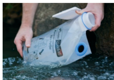
Fig. 1 The SolarBag by Puralytics in use.

Commercial options are also very limited, though one noteworthy example is the SolarBag by Puralytics (Fig. 1). 20 This is a promising example of solar photocatalysis being utilised to remove pollutants from water as a personal, point-of-source method and has won numerous awards for innovation in the field of water treatment. Puralytics claim that “The water is purified in 2–3 hours on a sunny day or 4–6 hours on a cloudy day or if the source water is tea-colored. An indicator tells you when the water is ready”. 20 However, the price-per-unit is very high ($80 for one bag, which is quoted to last up to 500 times), limiting its applicability in less affluent, rural areas, with much of its use being part of disaster relief or charitable provision.