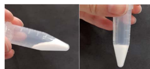
Fig. 1 DES in water emulsion (30 : 70 volume ratio) stabilised by 1.5 wt% OCNF after more than 200 days at room temperature.

The hydrophobic chains on C8-OCNF will allow greater interaction with the hydrophobic DES, compared to unmodified