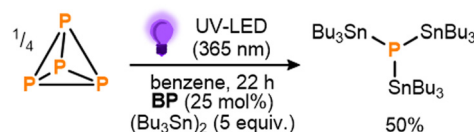
Scheme 3 Initial conditions for the direct, photocatalytic stannylation of P_4 into (Bu_3Sn)_3P optimized using benzophenone ( BP ) as photocatalyst. Stoichiometries in equiv. and mol% are defined per P atom.

These initial results provided a clear proof-of-principle for the proposed mechanistic strategy. Notably, the observed conversion indicates the activation of at least three Sn–Sn bonds per available equivalent of BP , 14 making this a rare example of a system where P_4 activation has been achieved catalytically, using an otherwise inert substrate. 5,9a,9b,9e,15 Nevertheless, in order to improve the reaction outcome further, a broader range of benzophenone derivatives was subsequently screened, with several found to provide markedly improved performance (see ESI,† S5). Particularly impressive results were achieved using