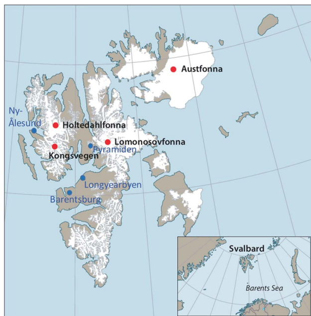
Fig. 17 Four glacial sites on Svalbard where ice core and/or surface snow have been analyzed for POPs deposition.

glaciers and ice caps sampled in these studies are >500 meters above sea level (MASL), they are likely receptors of pollution from LRAT, although it is recognized that the coastal communities in the southern part of Spitzbergen, the main island of Svalbard, are also a potential source of POPs. 199