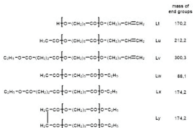
Scheme 5 Potential reaction products of the transesterifications of AcPCLUn with DESu catalyzed by neat TSA.

ratio of 2/1 was used corresponding to a 100/1 or 50/1 ratio of ethyl ester/undecenyl ester end groups. Due to this high molar ratio, almost all Ac and Un end groups were replaced by succinyl and ethyl end groups respectively. These data indicate, in turn, that intermolecular transesterifications were quite rapid and efficient even at 109 °C. The peaks of cycles were not detectable even in the ESI TOF mass spectra, a typical example of which is displayed in Fig. 8. In summary, all these transesterification experiments demonstrate that catalysis with TSA and with tin compounds agree in that intermolecular transesterification reactions are more efficient than equilibration via back-biting. In polymer melts intermolecular transesterifications may be slower than in the experiments with liquid esters conducted in this work. However, even when the efficiency of intermolecular transesterification is not higher than that of back-biting, the conclusions presented below are still valid.