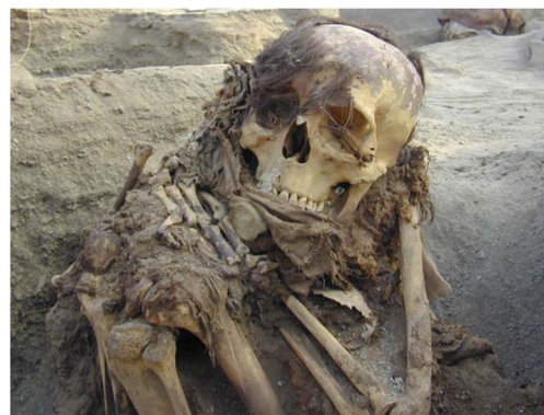
Fig. 1 Sample 28 in situ at the excavation site at Puruchuco-Huaquerones, Peru.

Eight human hair samples and nine mummy hair samples were used in this study, sample names and classifications are shown in Table 2. All nine mummy hair samples originate from mummified individuals from Puruchuco-Huaquerones, Peru (Fig. 1). The hair was collected directly from the mummified heads of individuals who had abundant hair (a minimum of 20 strands). A scalpel (cleaned with alcohol) was used to excise a portion of the scalp with the hair embedded. If the mummy had been exposed or was poorly preserved, the hair would no longer adhere to the scalp but be lying next to the scalp in the wrappings surrounding the head. In this case, it was collected by hand and the scalp end wrapped in tinfoil and then taped secure to orient the strand. In all circumstances, the hair was still associated with the skull, and it was not taken from any