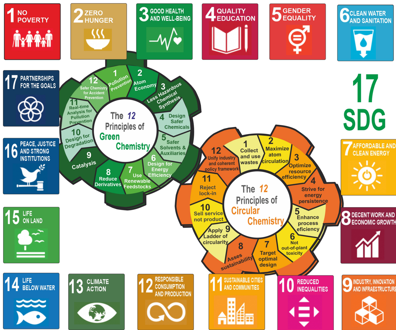
Fig. 1 Synergistic coupling between the two “sustainability engines”, represented by the Twelve Principles of Green Chemistry, 5 and the Twelve Principles of Circular Chemistry, 6 respectively, to achieve the 17 Sustainable Development Goals (SDGs), 4 launched by United Nations (UN) in 2015.