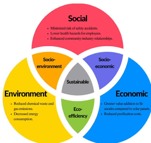
Fig. 3 Triple bottom line assessment Venn diagram.