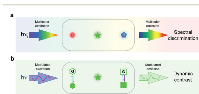
Fig. 1 Complementary spectral (a) and dynamic (b) dimensions for label discrimination. Spectral discrimination uses the responses of labels submitted to spectrally different conditions of illumination and light collection. Dynamic discrimination of spectrally similar labels exploits their time responses to the change of control parameters (e.g. light intensity). The spectral and dynamic discriminations exploit two orthogonal dimensions. They can be combined in order to further expand the number of labels, which can be discriminated in imaging. Fluorescence has been used here for illustration. In (a), R, G, and B respectively denote red, green, and blue absorbing/emitting fluorophores, which can be distinguished by means of optical filters. In (b), two RSFs engaged in reversible fluorescence photoswitching driven at two wavelengths (indicated by blue and violet arrows) with different photoswitching cross sections can be discriminated after the analysis of the modulated fluorescence emission resulting from the application of modulated light excitation.

In imaging, the common approach to discriminate a label from its background is to read out its signal in the spectral domain. In particular, it has found extensive use in fluorescence imaging, which has become essential for biology in view of the high sensitivity and versatility of fluorescence for labeling. 14 Two discriminative dimensions – the excitation and emission wavelengths – can be exploited to target a specific fluorescent label. Yet, the 50–100 nm half-width of the absorption/emission bands of the widely used fluorophores intrinsically limits spectral discrimination. Even with rich hardware of light sources and optical devices, at most four labels can be distinguished. Further increasing this number requires spectral unmixing but at significant cost in terms of photon budget and computation time. 15–22 Such constraints currently limit the discriminative power of emerging genetic engineering strategies, 23–25 which can already be implemented to label a larger number of biomolecules or cells in order to interrogate signaling pathways, 26 cycling states, 27 genotypes, 28,29 neuronal projections, 23,30,31 clones, 26–33 cell types, 34 or microbiomes. 35 Since fluorescence should remain a much favored observable for imaging live cells, 36 the spectral dimension has to be complemented by another dimension for further discriminating fluorophores (see Fig. 1a and b).