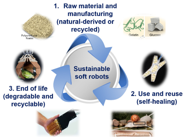
Fig. 1 The life cycle assessment of sustainable soft robots. Three main phases are classified from cradle to grave. Raw materials that are natural or recycled and manufacturing encode the original sustainable character at the start-of-life. Self-healing enables to reuse and refunction from damage at the middle-of-life. Degradable and recyclable allows degradation and recycle into a new life at the end-of-life instead of being discarded directly.

Inspired by living organisms which can heal and recover from injury, self-healable robots would reuse and refunction after damage with expanded lifetime. Self-healing function in robots