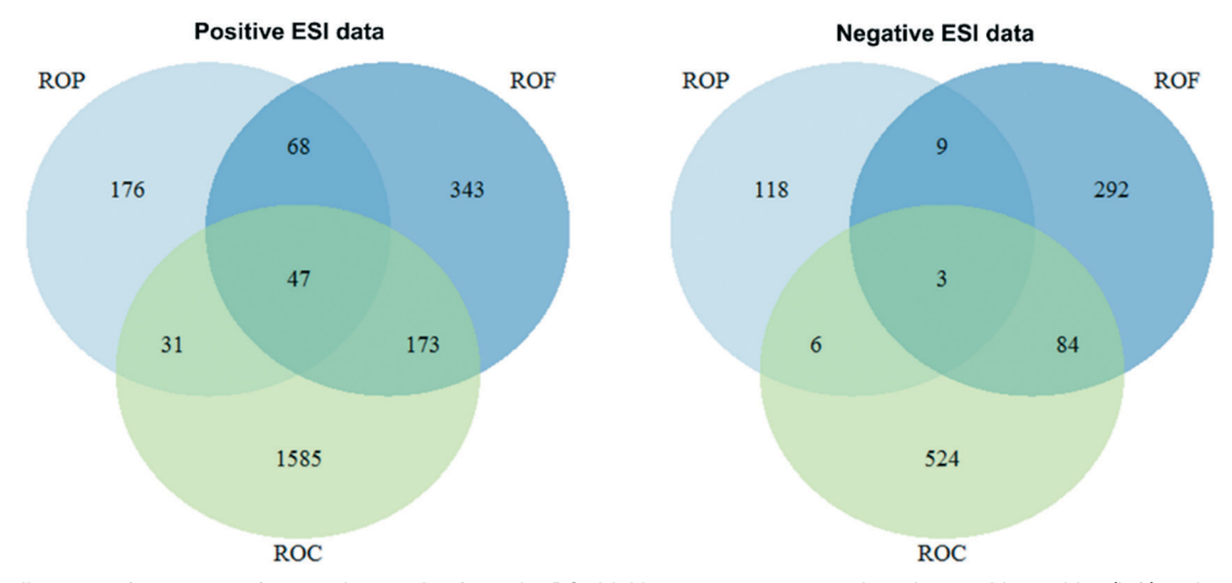
Fig. 2 Venn diagrams of non-target features in samples from the RO drinking water treatment plant detected in positive (left) and negative (right) electrospray ionisation (ESI) datasets. ROF: RO feed water; ROP: RO permeate; ROC: RO concentrate.