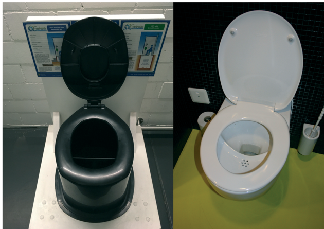
Fig. 1 The EnviroSan urine-diverting dehydration toilet (UDDT; left) and the Roediger urine-diverting flush toilet (right).

some popularity as an alternative to conventional dry toilets, especially because they give rise to less odor. 52 In Durban, South Africa, a new law obliged the municipality to provide sanitation to all from 2001, resulting in the installation of double vault UDDTs to serve the areas without sewers. 53 With urine infiltrating the ground and alternate use of the feces-containing vaults, it was possible to evacuate the vaults in a relatively safe way to gain organic matter for soil improvement. However, whereas Europeans are largely in favor of urine-separating flush toilets, albeit quite critical with respect to the toilet technology available, 51 the UDDTs are not at all popular in Durban. 54 With the flush toilet being the standard solution in the affluent parts of Durban, the affected population considers dry sanitation an unattractive and unjust solution for the poor. 55