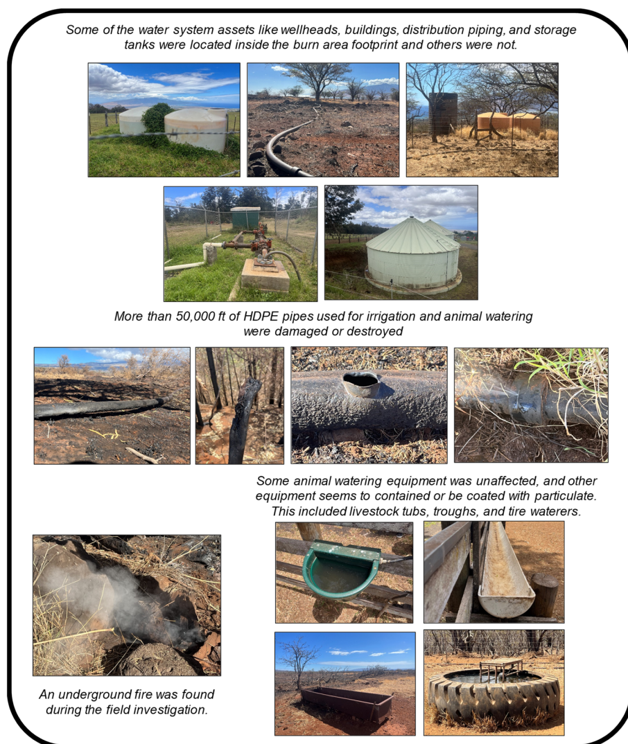
Fig. 3 Some agricultural water system assets were thermally damaged, destroyed, or impacted by particulate.

As of December 2023, Maui DWS had screened water samples from storage tanks, hydrants, and service lines for 24 of the 51 fire-related VOCs (Table 2). The most common chemicals and maximum concentrations detected by Maui DWS in Lāhainā were benzene (40 ppb), methylene chloride (3 ppb), ethyl benzene (2.5 ppb), total xylenes (2.4 ppb), and bis(2-ethylhexyl)phthalate (1.4 ppb), and toluene (1.3 ppb). For several samples, benzene exceeded the 5 ppb federal safe drinking water limit. In Kula, the most common detections and maximum concentrations found were benzene (3.8 ppb), methylene chloride (3.8 ppb), styrene (1.8 ppb), and toluene (1.6 ppb), and no chemicals exceeded federal drinking water