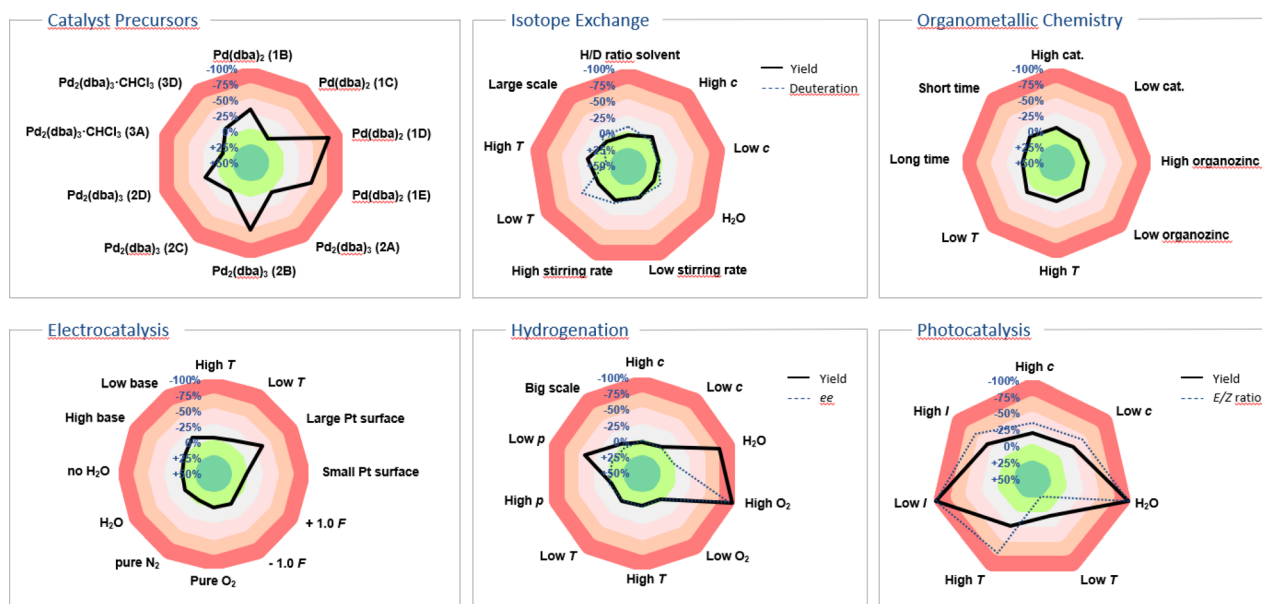
Fig. 2 Examples showcasing sensitivity screens tailored to diverse research fields. 13–16 In instances like hydrogenation, isotope exchange and photocatalysis the sensitivity screen was utilised to illustrate two target values, such as yield/deuterium incorporation, yield/enantiomeric excess and yield/ E:Z ratio, along with the parameters' impact on them.

Our innovation was embraced by the scientific community and has since been widely adopted for applications beyond the originally suggested ones. Originating from a background in photochemistry, we initially considered only yield as the target value and parameters such as: temperature, concentration, oxygen and moisture levels, light intensity, and scale. The use of the sensitivity screen within the scientific community, including our own group, has led to its adoption modified with additional parameters and target values. While the target value was formerly only yield, researchers have suggested and applied conversion, product ratio, selectivity, ee, throughput, TON, radiochemical yield (RCY), molar/specific activity ( A_m/A_s ), H/D -ratio, purity, space-time yield and enzyme activity, 12 and the standardisation of these terms has been a central achievement of the chemical community (Fig. 2). 13–16 Especially for industrial processes with more than one desired product, the reaction can be steered towards a customised product distribution, which might alter given the demand of the chemical product. A radar