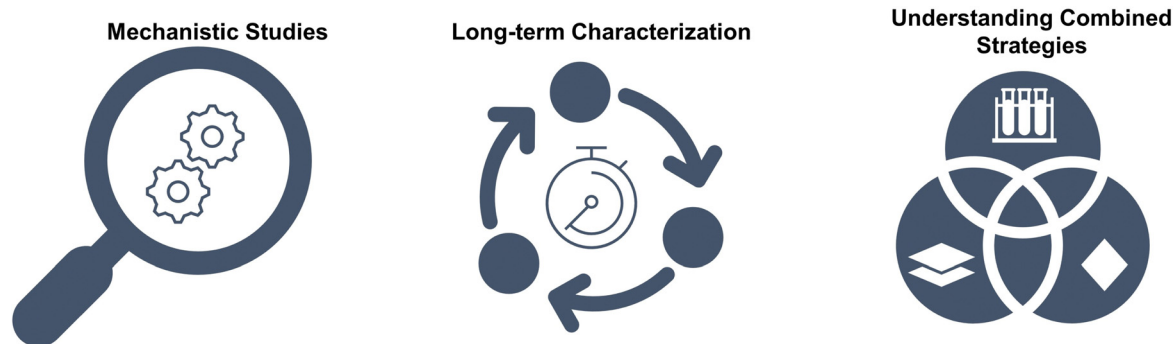
Fig. 4 Summary of avenues for further investigation in the interfacial engineering of lithium metal anodes.

these changes propagate through the lithium films as they become thicker (Fig. 3d). This question has implications for the mechanism of lithium deposition. By using scanning electron microscopy to visualize the diameter and thickness of lithium as it grows away from the current collector, we could understand how lithium growth structures at the monolayer level affect deposition beyond the monolayer level. This could provide insights into structural templates that are beneficial for depositing lithium particles with improved reversibility during battery cycling.