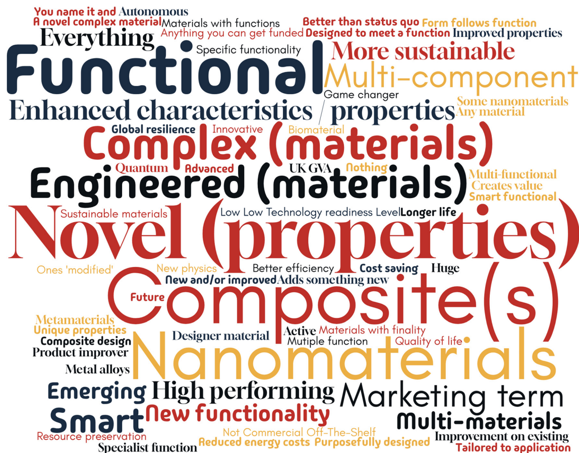
Fig. 1 Word cloud response to the question – What do you define as an Advanced Material? (111 responses). Note that limited preprocessing of responses was undertaken prior to generating word clouds to group similar terms and harmonise.

trust and acceptance by society, but the two most popular were understanding legislation and finance (Fig. S3†).