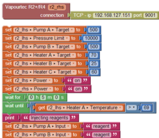
Fig. 1 Example of automated experiment using Blocktopus user interface.

An advantage of continuous-flow synthesis is the potential to scale up reactions simply by running the reactor system for