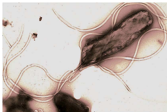
Fig. 2 Microscopic structure of Helicobacter pylori .

quad therapy, and sequential therapy. 39 Though these strategies have been effective in increasing the eradication rates, they are still accompanied by challenges like patient adherence to the prescribed medications, and possible side effects of the drugs. 40,41