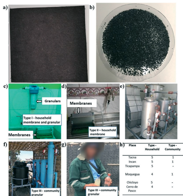
Fig. 2 (a) Photograph of the filtration membrane. (b) Photograph of the granular media. (c) Type I – household filtration unit (membrane and granular media). (d) Type II – household filtration unit (only the membrane). (e) Type III – community filtration unit in Torata. (f) Type III – community filtration unit (only granular) in Incan. (g) Water samples collected from the Incan area with high turbidity (sample in the left side: before filtration; sample in the right side: after filtration) and (h) the number of the household and community installations in the selected areas.

supply systems from April 2019 until July 2020. The samples were collected directly from the inlet and outlet of the filtration process and stored without any reagents. All the samples have been acidified using 0.1 M \text{HNO}_3 before analysis by AAS. The samples were analyzed for the residual arsenic concentration before and after the filtration at ETH Zurich using atomic absorption spectroscopy on a AAS240Z Zeeman graphite furnace (GTA 120) equipped with a PSD 120 programmable sample dispenser. In this study we measured the total arsenic content without distinguishing As (III) and As (V) in the water, before and after the treatment. The measurements were performed in triplicate, and the results were averaged. A separate calibration was done by measuring the standard solutions with various concentration regimes. The physicochemical parameters of the water before and after filtration is shown in ESI Table S2.†