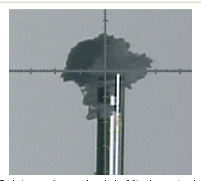
Fig. 1 A very small amount of powder (ca. 0.01 mg) mounted on the top of a glass fibre in the single crystal X-ray diffractometer. Each major tick represents 0.1 mm.

Of the 15 materials studied, 14 (Table 1) were solved to a high degree of accuracy using DASH. Only γ-carbamazepine