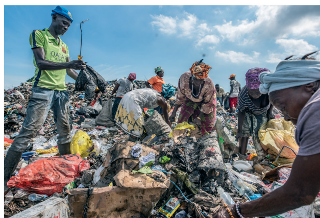
Fig. 2 Left: Operator moving waste after incineration in a public referral hospital, Sierra Leone. Right: People at public rubbish dump pick through the medical waste from a Community Health Post (CHC), Western Rural Area, Sierra Leone.

which are used in some low-resource settings, will not. In addition, when dumped in landfills (Fig. 2), plastics will persist for hundreds of years in the soil. The sustainability and safety of single-use POCTs could, to various degrees, be improved by technological solutions.