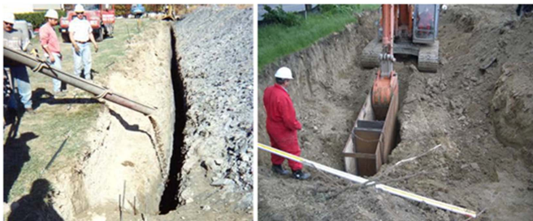
Fig. 2 Top – Diagram illustrating permeable reactive barriers in (a) continuous and (b) funnel and gate configurations at the Oak Ridge Y-12 Site, Tennessee. In both instances, contaminated groundwater passes through a reactive medium, where contaminants are removed, and clean water passes out the other side. Funnel and gate configurations have the addition of concrete barriers to channel groundwater flow. Bottom – Photos from ITRC 82 showing unsupported (left) and temporary trench box (right) excavation during PRB installation at non-nuclear industrial sites. Reactive media is poured into the hole to complete the PRB.

remediators' discretion. However, a less invasive approach was adopted at the Hanford site to reduce the ^{90}\text{Sr} activity reaching the Columbia River. 95 A solution of Ca, citrate and \text{PO}_4^- was added to the groundwater through boreholes, 96,97 creating a diffuse, continuous calcium phosphate (apatite) barrier that formed in situ from a series of discrete points at the surface. 98 Once formed, Ca in the apatite will substitute with Sr in the plume, as the existence of strontianapatite is more thermodynamically favourable than the initial hydroxyapatite. 99 Four pilot boreholes were initially injected between 2006 and 2008, with pre-barrier activities ranging from 36.5 \text{ Bq L}^{-1} to 171.3 \text{ Bq L}^{-1} ( 972 \text{ pCi L}^{-1} to 4630 \text{ pCi L}^{-1} ) ^{90}\text{Sr} . 6 As of 2021, activities within the boreholes have dropped to 4.1\text{--}23.5 \text{ Bq L}^{-1} ( 111\text{--}635