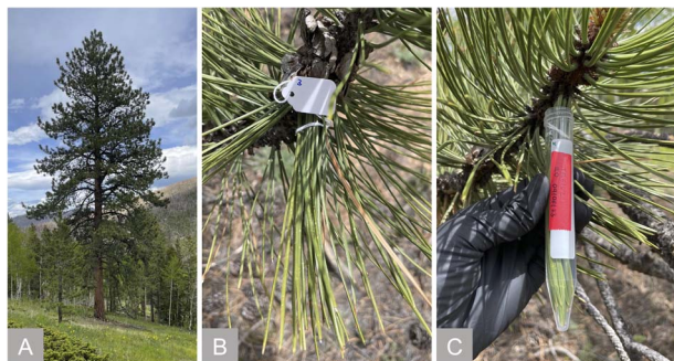
Fig. 1 Ponderosa pine specimen from sampling at the CSU Mountain Campus on June 19, 2023 (A). In a typical soak, healthy needles growing in proximity were bundled together (B) and soaked for 5 min in 10 mL of MilliQ water in a pre-leached falcon tube (C).

cotton string (Fig. 1B). The bundle was then soaked for 5 min in a pre-leached falcon tube containing 10 mL of MilliQ water (Fig. 1C). Variations of this protocol allowed us to investigate the effect of specific sampling variables – e.g. , we modified the number of needles from 5 to 20, the soaking time from 5 seconds to 1 hour, and used natural rain instead of MilliQ water as the solvent (details in ESI†). In addition to soaks, we collected authentic raindrops during three rain events (Text S2 and Table S2†). In all cases, we handled needles with gloves to minimize contamination.