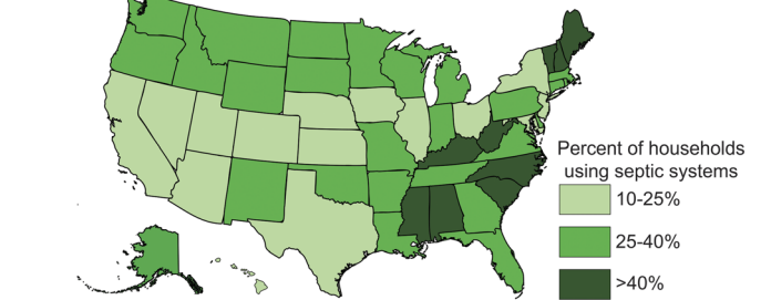
Fig. 1 US Census 1990 – percent of households using septic systems by state, illustrating the wide variability in septic system usage across the United States and highlighting the potential for geographic nutrient recovery and environmental protection through improved septage management practices.<sup>3</sup>