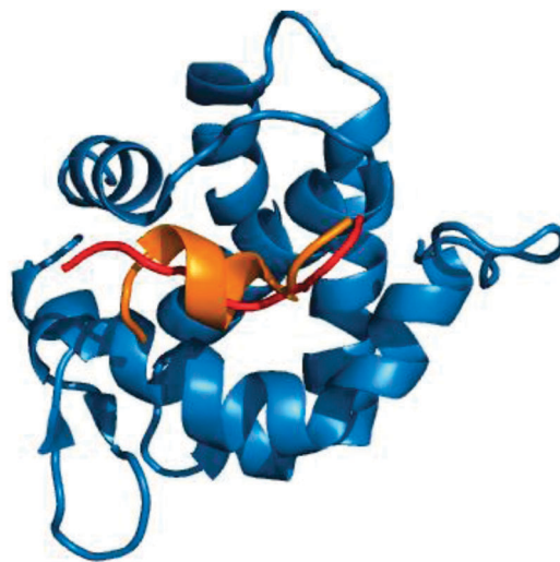
Fig. 6 The interaction of the E1A viral oncoprotein with a retinoblastoma protein is realized via an \alpha -helix and a turn secondary structure element (PDB code: 2r7g).

Owing to the genetic compaction of viruses, the encoded proteins should be involved in multiple functions, e.g. capable of establishing interactions with different partners. This could be facilitated by the underlying conformational heterogeneity of the viral proteins, which allows the ensemble to shift between different conformational states upon responding to different signals. Our results indicate that viral motifs have increased local flexibility or disorder relative to their 20AA flanking regions. We discussed examples for dynamic fuzziness, when the protein interconverts between multiple conformations in the bound state. 5,6 In the case of static fuzziness however, the ID protein folds upon interacting with the partner, but adopts alternative conformations. 5,6 17% of the human virus ELMs are located in ordered regions; these were analyzed for static fuzziness. To this end, we collected the structures of the host-virus complexes of these ELMs and different secondary structure conformations upon targeting the same host protein were identified (Table S5, ESI†). The adenovirus E1A protein interacts with a retinoblastoma