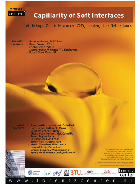
Fig. 1 This Opinion emerged from discussions during a workshop on Capillarity of Soft Interfaces, hosted by the Lorentz Center at the University of Leiden in November 2015. (Poster designed by SuperNova Studios, NL).