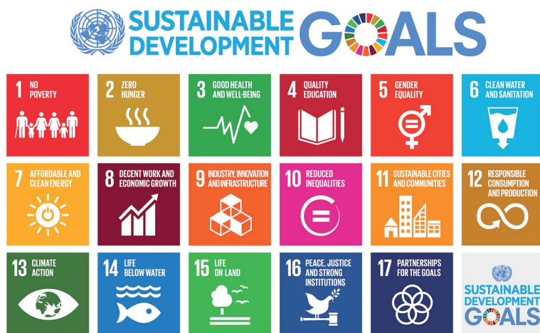
Fig. 1 The 17 SDGs of the UN, aimed at ending poverty, protecting the planet, and ensuring prosperity for all as part of the sustainable development agenda. Each goal has specific targets to be achieved over the period 2015–2030 ( http://www.un.org/sustainabledevelopment/sustainable-development-goals/ ). An 18 th SDG aimed at clean air should be added.

It is proposed here to adopt an additional SDG on “clean air”, at the same level as good health, clean water, sustainable industrialization and cities, responsible production, climate action, marine and terrestrial life (SDGs 3, 6, 9, 11, 12, 13, 14, 15, respectively), not only because ambient air pollution is the leading environmental risk factor of the global burden of disease, 8 but also because many other SDGs cannot be achieved without considering air quality. The next Section 2 focusses on results from the Faraday Discussion meeting Atmospheric chemistry in the Anthropocene , held in York, UK, from 22–24 May 2017, which presented scientific results that underpin this statement. Section 3 presents an update of the