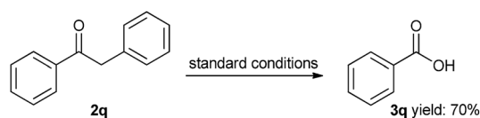
Scheme 2 Oxidative reaction of 2-phenylacetophenone.

To gain insight into this oxidative reaction, control experiments were employed as shown in Scheme 4. Firstly, the reaction