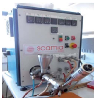
Fig. 7 Representation of a single-screw extruder.