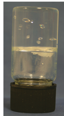
Fig. 5 Crystals of Form III carbamazepine growing in a supramolecular organogel (reproduced with permission from ref. 44).

There are also recent developments in increasing throughput and control, influencing morphology or altering key properties such as dissolution rate, bioavailability, processability, stability and compressibility. 32 There has been considerable progress in the use of micro- or nanoconfinement for crystallization. Crystallization in microemulsion droplets has been shown to ‘leapfrog Ostwald’s rule of stages’ and home in on the most thermodynamically stable solid form under a given set of conditions. 33,34 In addition to molecular compounds such as pharmaceuticals, 35 the method has also been applied to nanomaterials such as nanographite. 36 Nanoscale confinement in materials such as porous polymers and nanoporous glass is also a powerful new crystallization tool. 37 As Ward points out in a recent review: “nanoscale confinement examines nucleation and phase transformations at length scales corresponding to the critical size, at which kinetics and thermodynamics of nucleation and growth intersect and dramatic departures in stability compared to bulk crystals can appear”. 38 Confined crystallization has been shown to result in novel outcomes