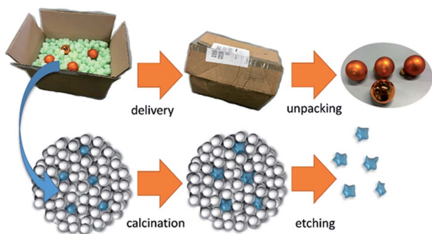
Fig. 1 Similar to foam peanuts, which are used as protectant against mechanical damage in the packaging of fragile products, SiO 2 NPs protect sinter-labile NPs within a supraparticle during calcination.

The obtained supraparticles resemble raspberries in their structure 28 and allow the calcination of the desired NP type. After calcination of the supraparticles, the (non-silica) NPs are regained as monodisperse sol via dissolution of the silica components in a strong base. Fig. 1 depicts the principle of this fabrication route using silica NPs as protectant against sintering, which is similar to foam peanuts as protectant against mechanical damage in the packaging of fragile products. However, it should be noted here that a difference between using foam peanuts for transport (as well as the mentioned approaches of embedding NPs in a gel or a salt matrix) and the herein proposed method is the formation of supraparticles instead of simply mixing both nanoparticles types. This brings the advantage of providing a free flowing micropowder sample after calcination (Fig. S1 in the ESI†) and thus, faster dissolution of the silica components due to a better accessibility compared to bulk material.