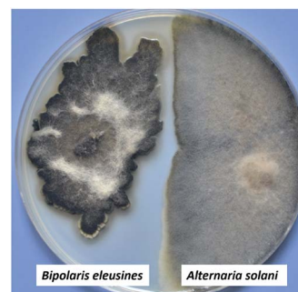
Fig. 1 The growth inhibition of potato endophytic fungus B. eleusines against potato pathogen Alternaria solani on PDA.

Bipolenin I ( 1 ) had a molecular formula \text{C}_{31}\text{H}_{36}\text{O}_9 as determined on the basis of the positive HRESIMS, which showed a molecular ion peak at m/z 575.2250 [\text{M} + \text{Na}]^+ (calcd for \text{C}_{31}\text{H}_{36}\text{O}_9\text{Na} , 575.2252), corresponding to seven degrees of unsaturation. The UV data at 329 nm indicated a highly conjugated system, while the IR absorption bands at 3440 and 1745 \text{cm}^{-1} suggested the existence of hydroxy and carbonyl, respectively. The ^1\text{H} and ^{13}\text{C} NMR spectra, in association with the HSQC spectrum, revealed six methyl (one methoxy), four methene, nine methine, and twelve quaternary carbons (Table 1). Preliminary analysis on the NMR data, a possible moiety of sativene sesquiterpenoid was detected by comparison the data with those our reported previously. 1,2,4,11–13 As shown in unit A of Fig. 3, a long spin system was obtained by analysis of the ^1\text{H} – ^1\text{H}