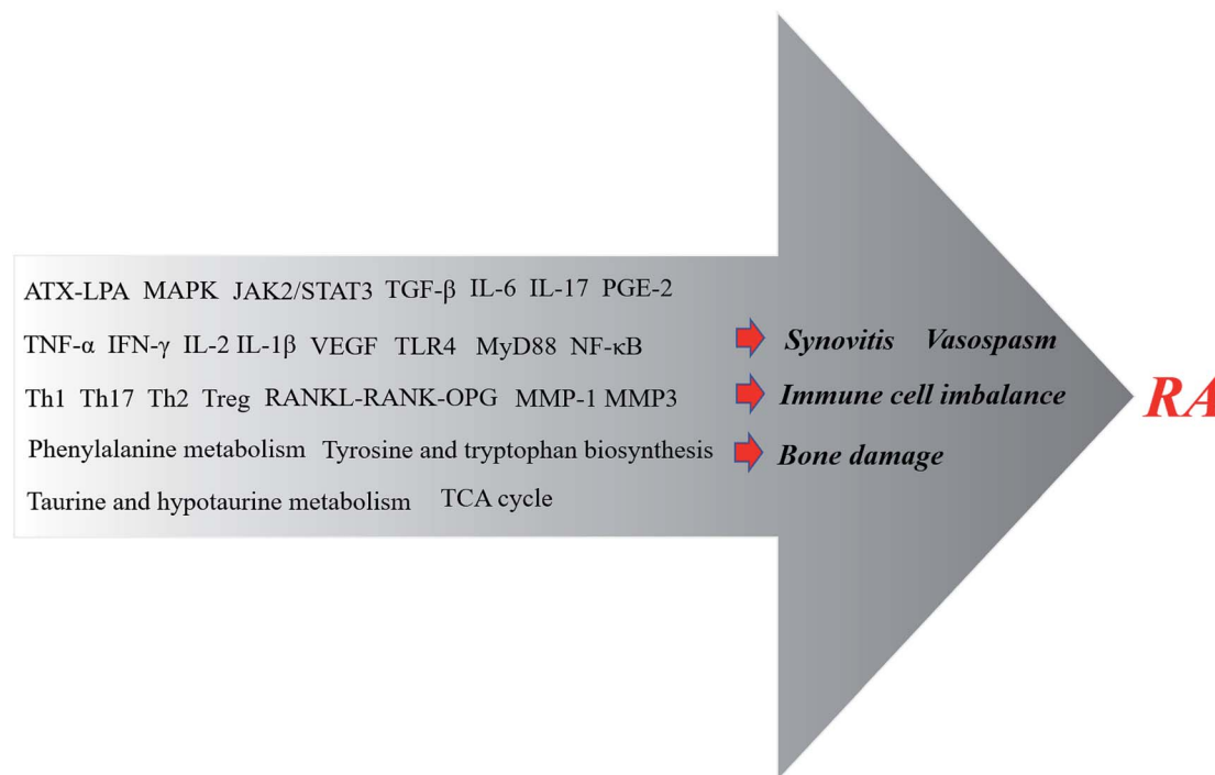
Fig. 2 Anti-RA CHMs utilize a series of mechanisms that ultimately inhibit synovitis, vasospasms and bone damage, and address immune cell imbalances.