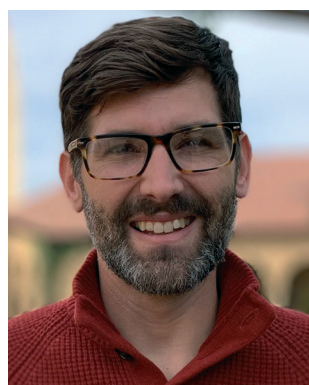
Eric A. Appel

Gels were formed at 2 wt% of HPMC-C x and 5 wt% of PSNP by mixing the two components followed by centrifugation to remove bubbles.