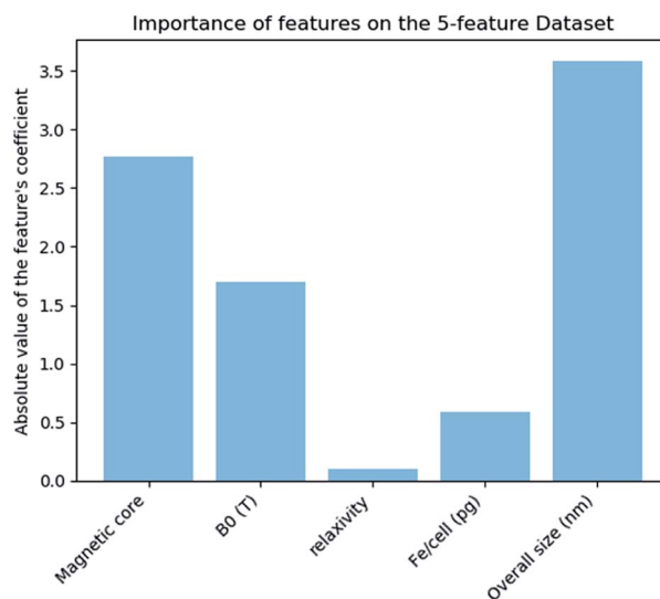
Fig. 3 Bar chart of the feature importance in the full nanoQSAR model.